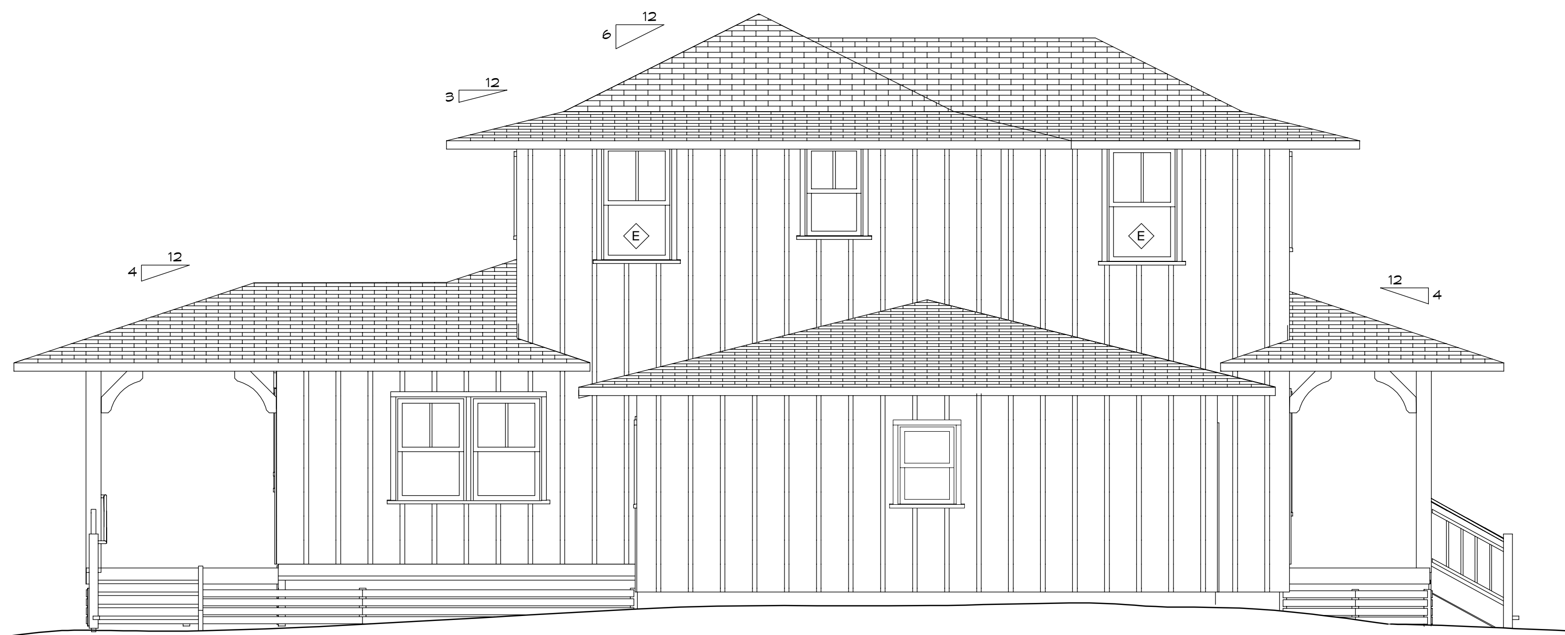
1 SOUTH ELEVATION A-3 SCALE: 1/4" = 1'-0"