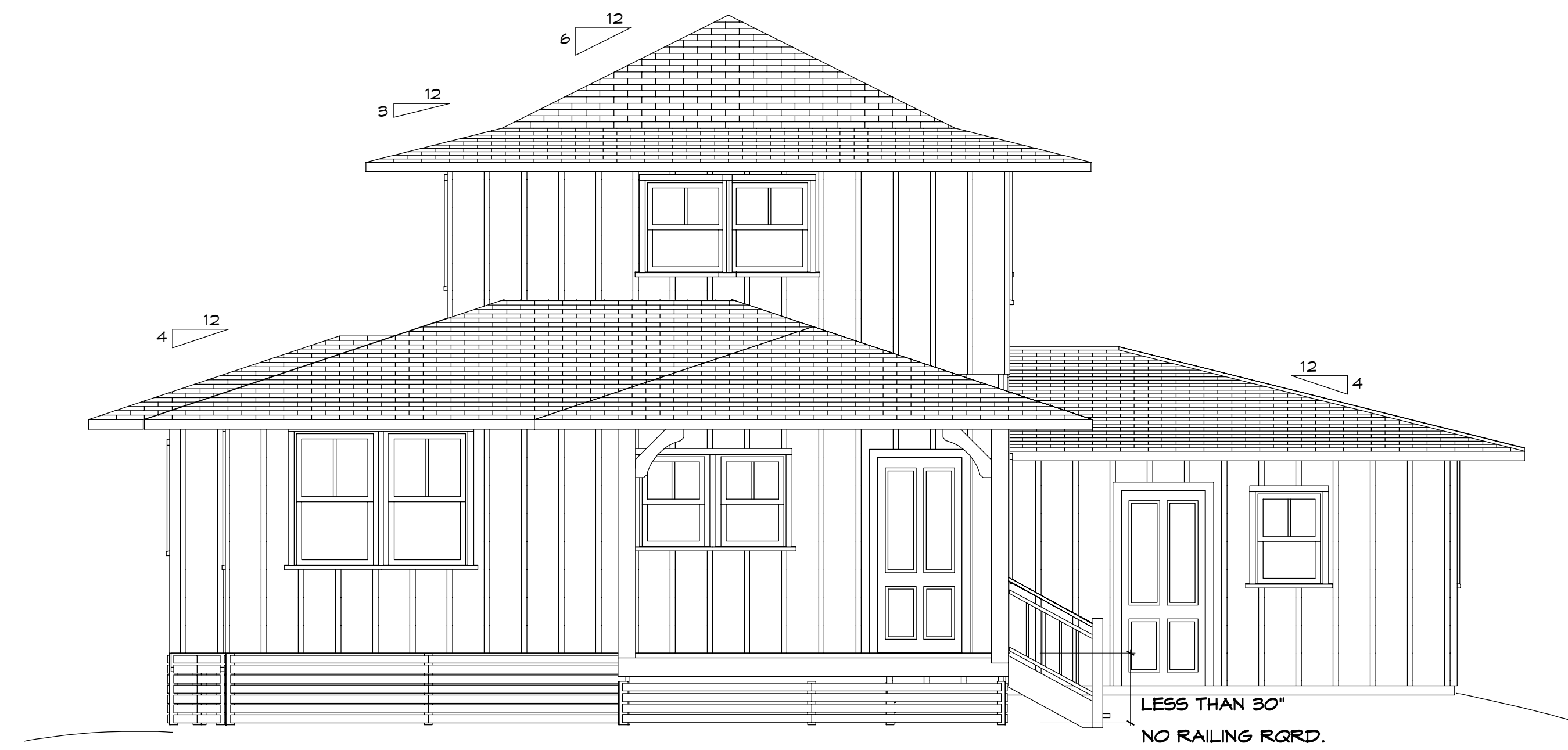
4 WEST ELEVATION A-3 SCALE: 1/4" = 1'-0"

JOHNSTON • CASSEL DESIGN STUDIO 71 BALDWIN AVE., B-6 P.O. BOX 790731 PAIA, MAUI, HI 96779 (808) 579-9778 PHONE (808) 579-9778 FAX info@johnstonscassel.com